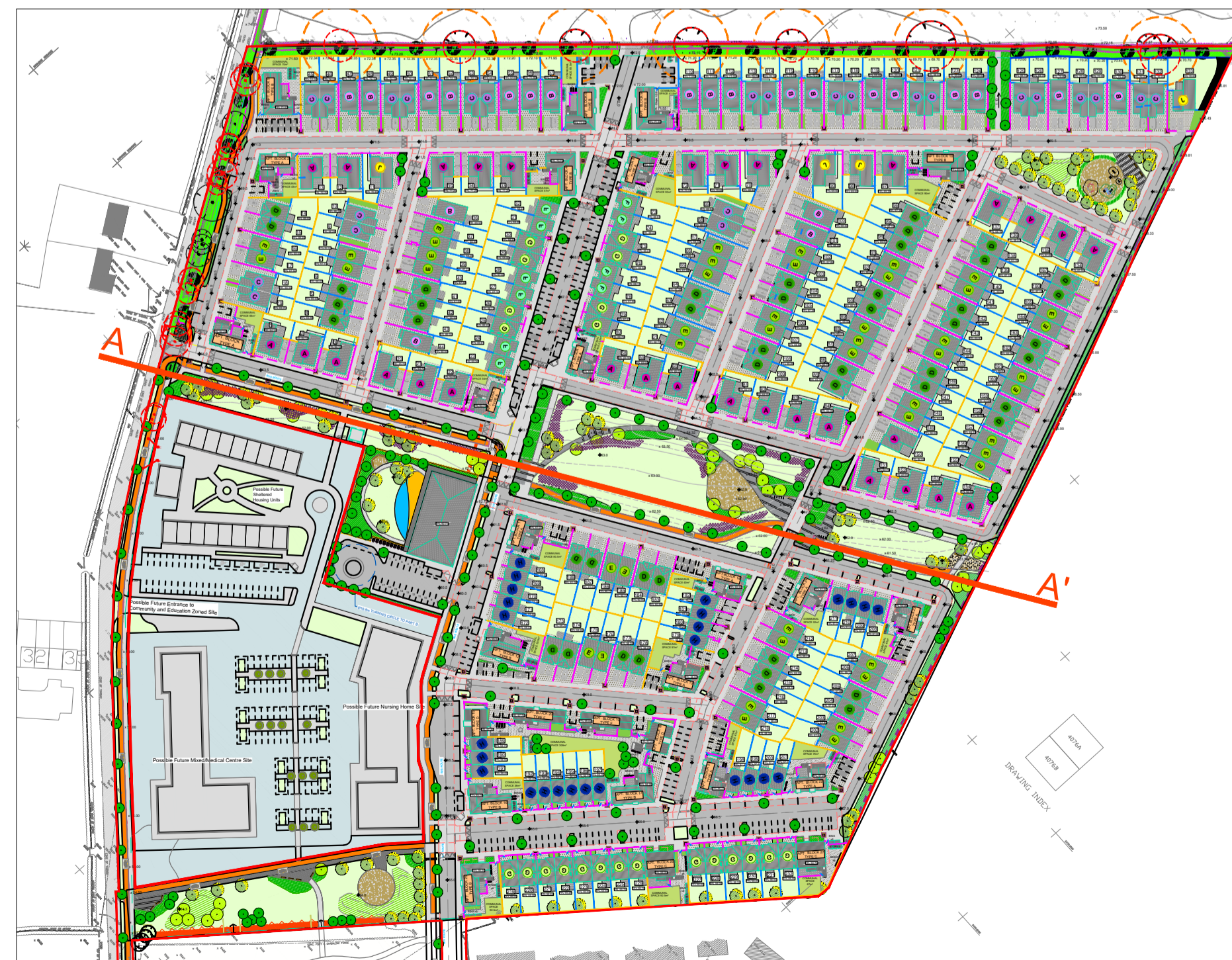
SECTION KEY Scale 1:2000